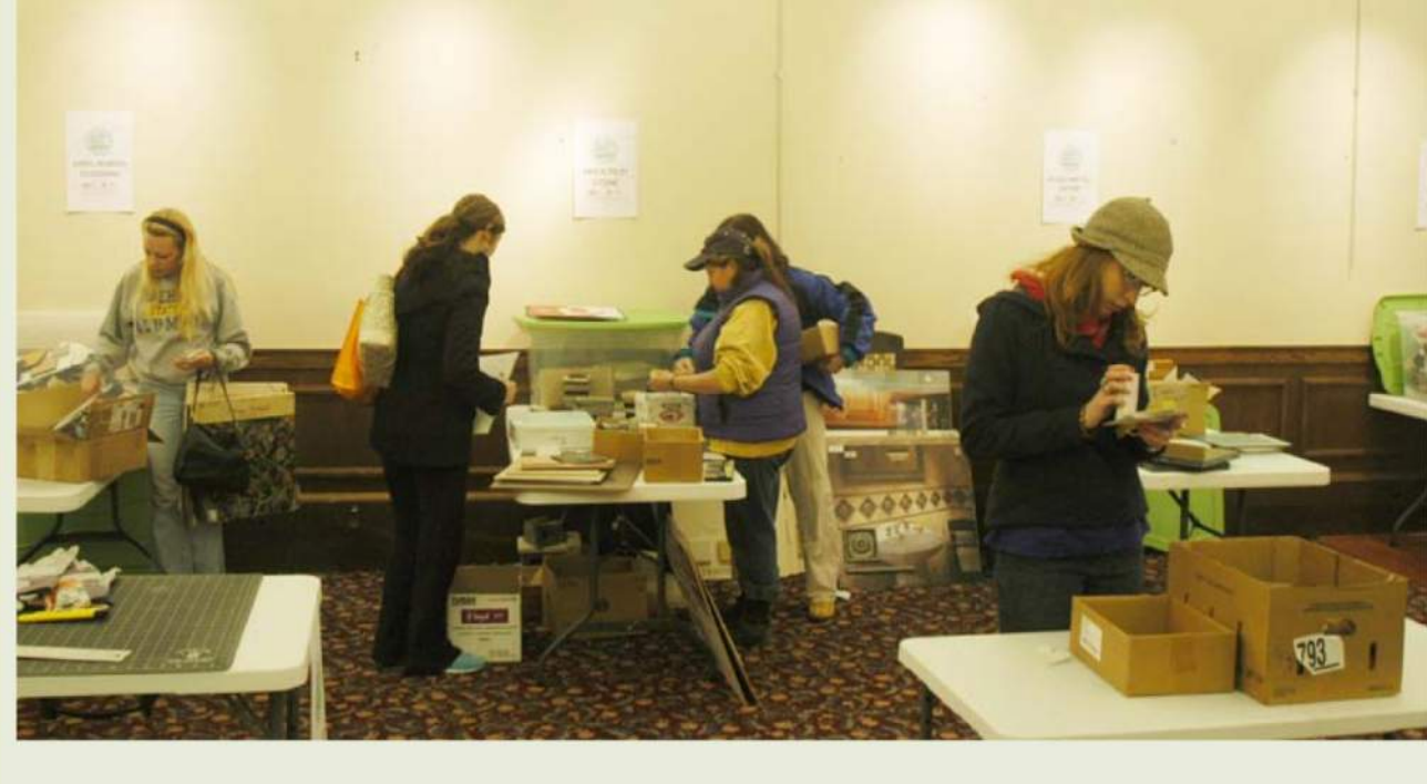
WBOY-Artist Benefit from Resample Event in Morgantown Dominion Post Article